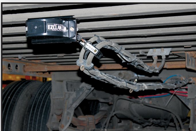
(Steel Cross Member Shown)