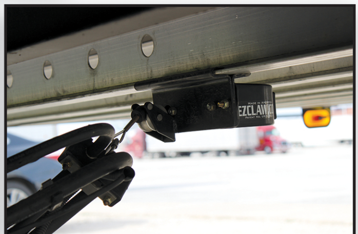
(Aluminum Cross Member Shown)