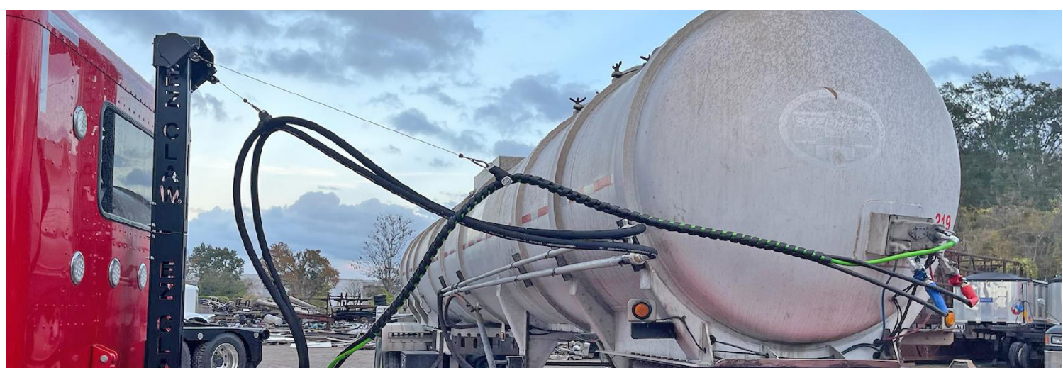
Distributor Contact Information